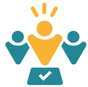
Everyone is a leader

Our Civica Leadership Forum agreed, and have seen first-hand, that almost everyone working in the public sector starts with a determined sense of ‘public service’. They are passionate about making a positive difference to the society in which they live and firmly believe they can be the ‘agent of change’ to make this happen. But often frustration sets in. So, what is influencing this slow-down of positive change? Our Leadership Forum agreed that there needs to be a radical change in not only leadership style, but also the organisational structure and culture across the sector.