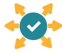
Light touch rules

The public sector has spent decades working in professional silos. So, how do you break down the barriers and create teams that work together across agencies? We need to encourage the rebels to take action, to drive ongoing learning and improvements, for everyone to see that their role is constantly evolving.